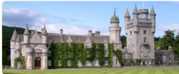
Balmoral Castle is in Aberdeenshire, Scotland. It is used mainly as a holiday home for the Royal Family.