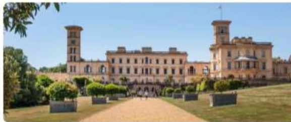
Osborne House is on the Isle of Wight, England. This was Queen Victoria's favourite holiday home.