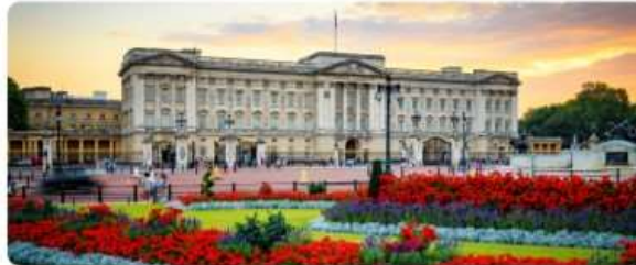
Buckingham Palace is in London, England. It is the Queen's main residence.

Royal residences include palaces, castles and stately homes. Some of them are used for official royal business and some are used as holiday or private homes.