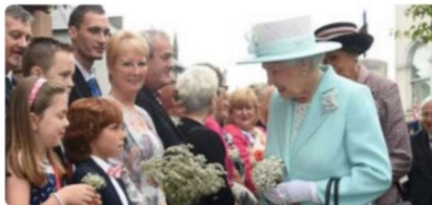
The Queen meets lots of people.

Elizabeth II is the Queen of the United Kingdom. She was born in 1926 and became queen in 1952. The Queen is married to Prince Philip and has a large family. She lives in Buckingham Palace in London. The Queen is very important. She visits charities and schools in the United Kingdom and welcomes world leaders to Buckingham Palace.