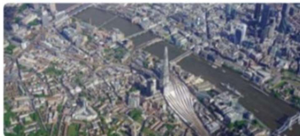
Aerial view of London

A city is a large, busy settlement where lots of people live and work. A city usually has a cathedral, a river, important buildings and offices where people work. There are lots of things to see and do in a city. There are many shops and restaurants to visit.