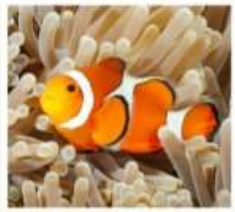
Clownfish are fish.