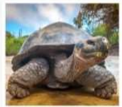
Tortoises are reptiles.