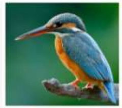
Kingfishers are birds.