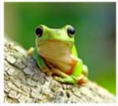
Frogs are amphibians.