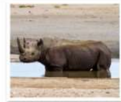
Western black rhino