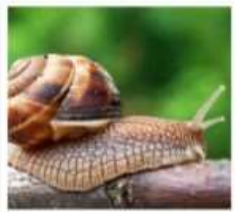
Snails are invertebrates.