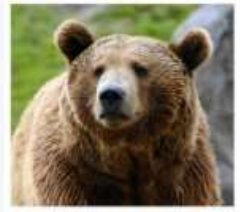
Brown bears are mammals,

Animals can be sorted into six different groups. These are mammals, amphibians, birds, fish, reptiles and invertebrates.